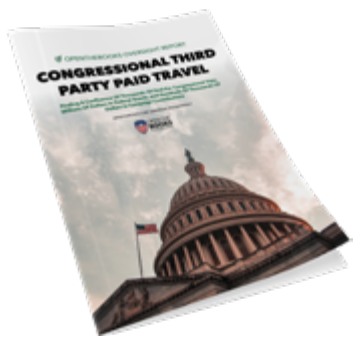
CONGRESSIONAL THIRD PARTY PAID TRAVEL