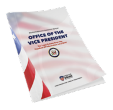
VICE PRESIDENT The Legal Debate Over The Freedom Of Information Act