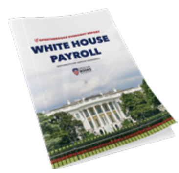
WHITE HOUSE PAYROLL