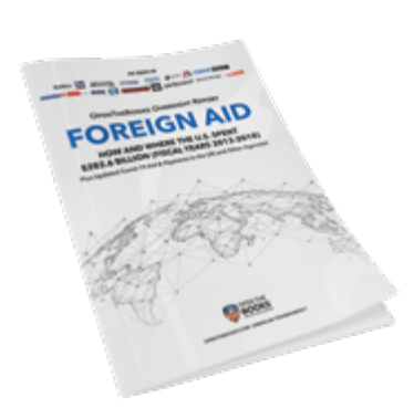
U.S. FOREIGN AID

How and Where The U.S. Spent $282.6 Billion (FY2013-2018)