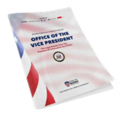
OFFICE OF THE VICE PRESIDENT

The Legal Debate Over The Freedom Of Information Act