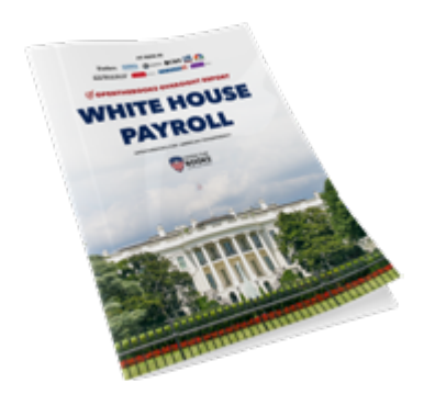
WHITE HOUSE PAYROLL