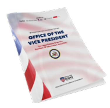
OFFICE OF THE VICE PRESIDENT Freedom Of Information Act