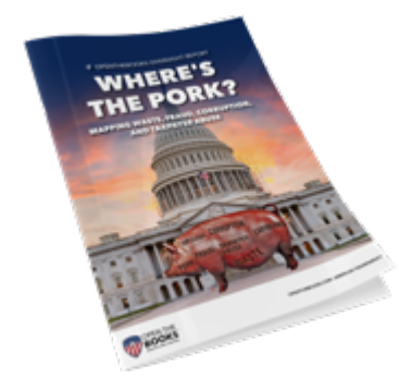
WHERE'S THE PORK? Mapping Waste, Fraud, The Legal Debate Over The Corruption, and Taxpayer Abuse