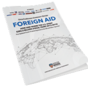
U.S. FOREIGN AID How and Where The U.S. Spent $282.6 Billion (FY2013-2018)