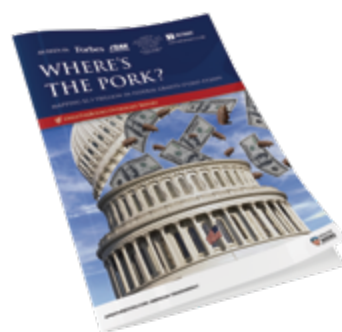
WHERE'S THE PORK? Mapping $2.3 Trillion in Federal Grants (FY2017-FY2019)