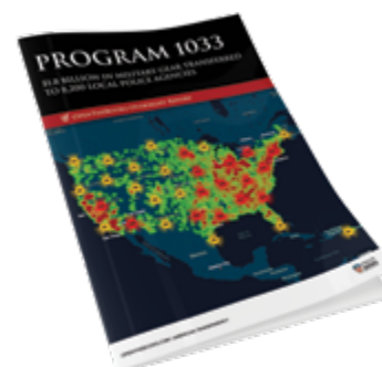
PROGRAM 1033 $1.8 Billion In Military Gear Transferred To 8,200 Local Police Agencies