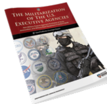
THE MILITARIZATION OF THE U.S. EXECUTIVE AGENCIES