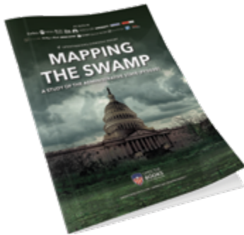
MAPPING THE SWAMP A Study of the Administrative State (FY2020)