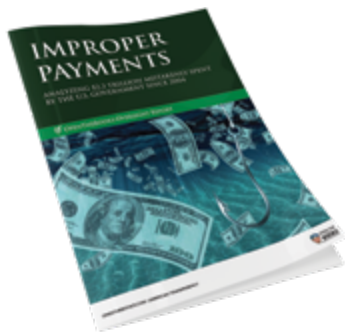
IMPROPER PAYMENTS Analyzing $2.3 Trillion Mistakenly Spent By The U.S. Government Since 2004